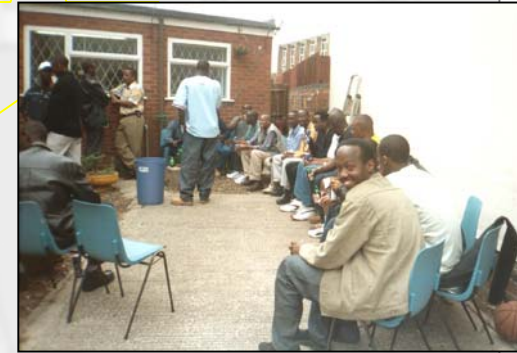
Asylum Seekers and Refugees Group

Kanoon Bham Santoor (Iranian music group) A.S.H.E. (African drumming) Drama (Iranian) Burundian Group Zimbabwean Group Rwandan Muslim Group Burundi Muslim Group